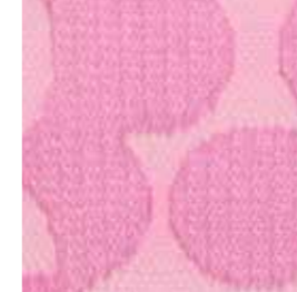
00005 ROSA - PINK РОЗА