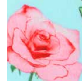
00041 AZZURRO - LIGHT BLUE СВЕТЛО-СИНИЙ

COMP: 86% PL - 14% EA (tessuto / fabric / ткань)