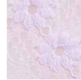
00011 LILLA - LILAC СИРЕНЬ