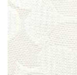
00216 BIANCO LATTE WHITE MILK БЕЛОЕ МОЛОКО