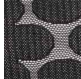
00002 NERO - BLACK ЧЕРНЫЙ

COMP: 83% PA - 17% EA (tessuto / fabric / ткань)