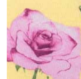
00363 POLLINE - YELLOW ЖЕЛТЫЙ