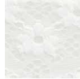
00001 BIANCO - WHITE БЕЛЫЙ

COMP: 93% PA - 7% EA (pizzo / lace / кружево)