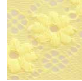
00363 POLLINE - YELLOW ЖЕЛТЫЙ